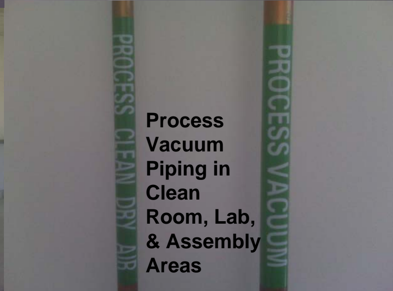
Process Vacuum Piping in Clean Room, Lab, & Assembly Areas