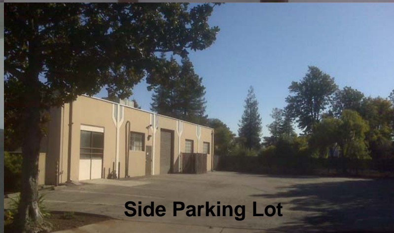
Side Parking Lot