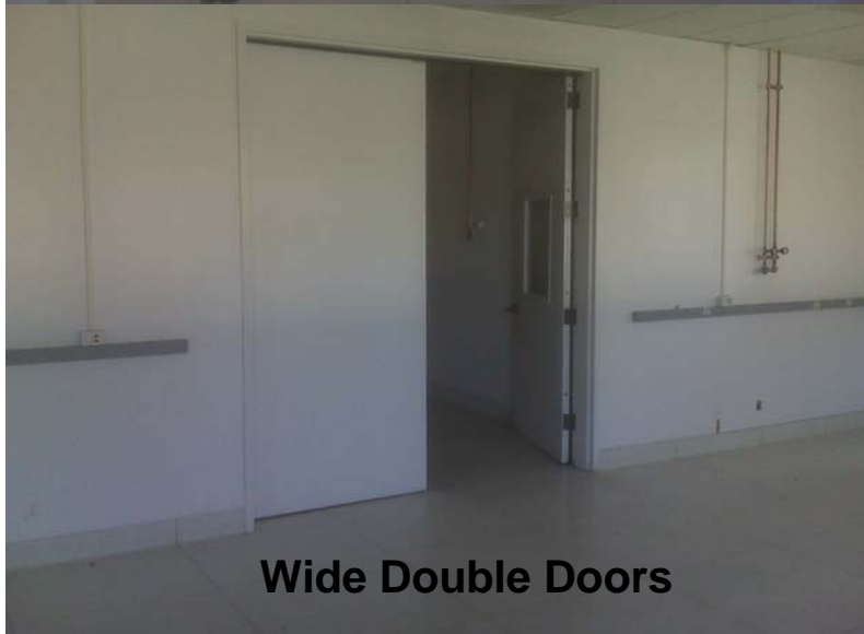
Wide Double Doors