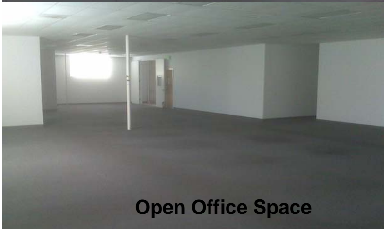
Open Office Space